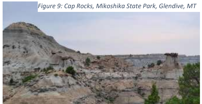
Figure 9: Cap Rocks, Mikoshika State Park, Glendive, MT

Our partners from the Office of Consumer Protection have sent us new materials for 2021. They have been and will continue to be shared with clinic attendees to increase the knowledge of important resources. AARP has also sent us a fresh batch of hand outs, fliers, and trinkets to help get the word out about senior resources.