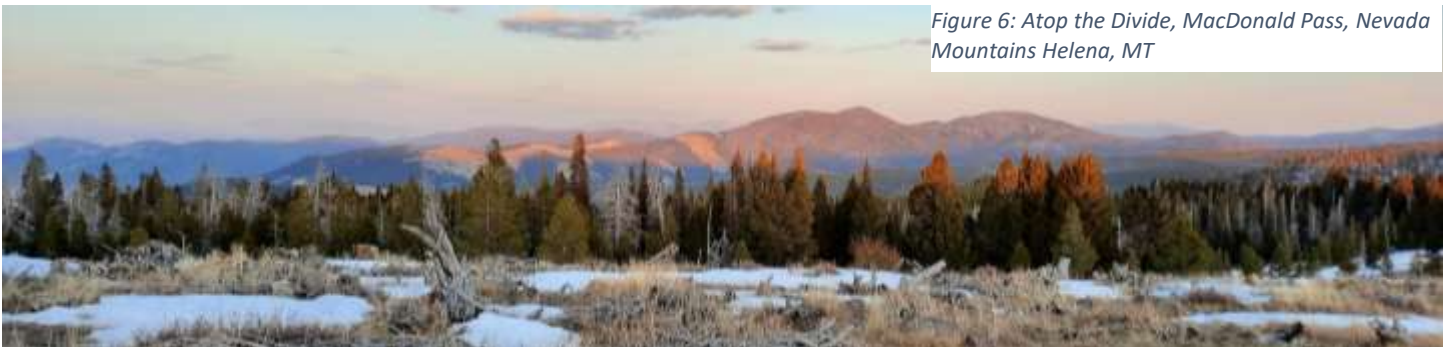
Figure 6: Atop the Divide, MacDonald Pass, Nevada Mountains Helena, MT

Analysis of the clinic evaluations showed that 82% of Lewistown attendees were “extremely satisfied,” 18% were satisfied. 100% of Deer Lodge attendees reported being “extremely satisfied.”