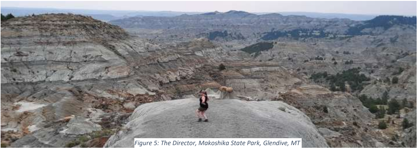
Figure 5: The Director, Makoshika State Park, Glendive, MT