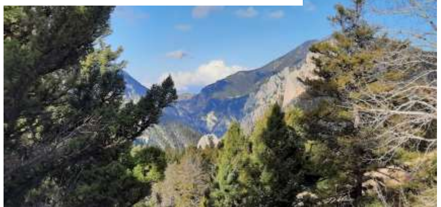
Figure 1: Top of the 'Fridge, Big Belt Mountains, Nelson, MT

This is the 11 th quarterly newsletter. Whether you signed up at a training, clinic, or at a presentation, we are happy you have taken an interest in our project and we are excited to tell you about our recent progress.