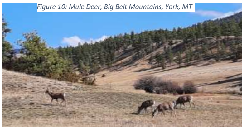
Figure 10: Mule Deer, Big Belt Mountains, York, MT

Advocacy Cases Although we don't receive a huge amount of exploitation reports, the ones we do are handled with great care to ensure the right agencies and advocates are involved. In one case this quarter, a senior called us about credit card fraud. A scammer stole the senior's credit card number, took out a cash advance, then deposited it in the senior's bank account and sent the money to someone else via wire transfer. Although the senior reported the fraud, because the money was deposited in the senior's account, then paid out, the CC company and the bank are denying the claims. We shared a list of organizations that