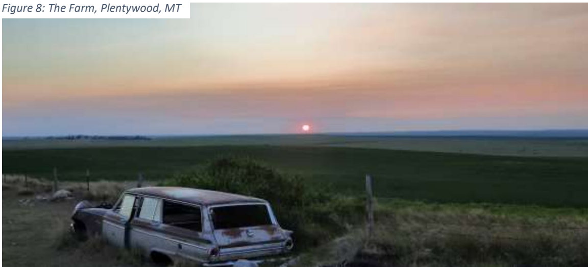
Figure 8: The Farm, Plentywood, MT

a very important partner, supplementing our grant when we need something our funds can't cover, like refreshments