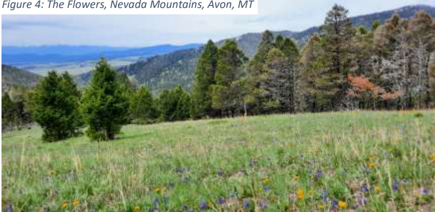
Figure 4: The Flowers, Nevada Mountains, Avon, MT

Our first was a remote clinic hosted with the help of the Alexander Blewitt III's Pro Bono Program and many great student volunteers. We helped 13 seniors complete their custom estate planning packages, including documents like Wills, Powers of Attorney, and Declarations of