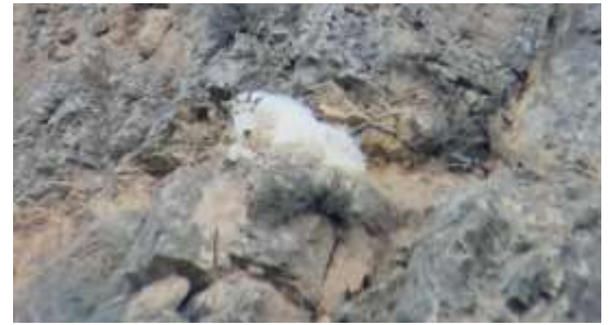
Figure 7: Mountain Goat, Refrigerator Canyon, Big Belt Mountains, Nelson, MT

In the spirit of public safety, we have also created a safety protocol to be posted and shared at events to inform attendees, volunteers, and staff on the proper steps to take in case of emergencies like fires, active shooters, earthquakes, and more. We are happy to share this and all tools created by the Senior Financial Defense Grant. Simply contact Richard.heitstuman@mt.gov for copies.