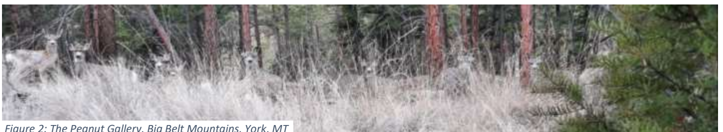
Figure 2: The Peanut Gallery, Big Belt Mountains, York, MT

Outreach and Training Our training series for senior advocates continues! This quarter, we hosted trainings on topics like using “MT’s File Transfer Service,” “Powers of Attorney vs. Guardianships,” “Estate Planning 101,” “Social Security 101,” “Working with Adults with Disabilities – Communication,” “Supported Decision Making,” and “Elder Law Resources.” These trainings are attended by employees of MT’s Area Agencies on Aging, Ombudsman, APS workers, and advocates from all over the state. They are typically posted to our DPHHS website, but it is currently undergoing a major makeover. Once we are able to post