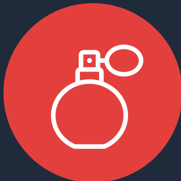
Strong Odors (cleaning products, paints, perfume/cologne, ect.)