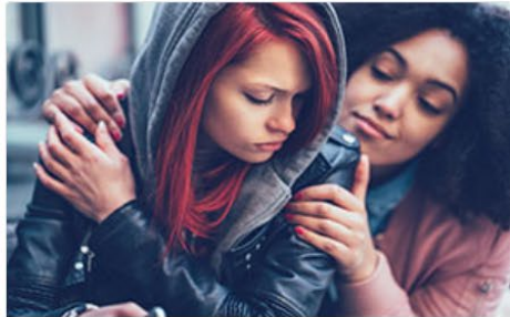
Treatment for Opioid Use Disorder

The 2023 MT Legislature passed HB43Z , allowing for Fentanyl Test Strips (FTS) to be distributed. Individuals and organizations can order Fentanyl Test Strips .