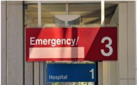
Opioids and Overdose

If you or someone you know would like resources on naloxone, connecting to a harm reduction organization, or how to access treatment, and find recovery – visit www.TogetherWeCanMT.com